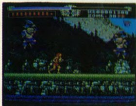
The Legendary Axe

Also Win A Library of Great Turbogرافx 16 Games: