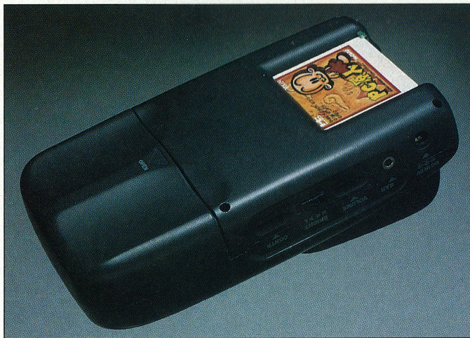
The compact size of the TurboChips makes it easy for NEC to work a portable around them. A slot at the top rear of the TGP holds the cartridge (in this case, the Japanese version of Bonk's Adventure ); the door at the bottom opens to house six "AA" batteries.

My palms are getting sweaty just thinking about it. 🙄